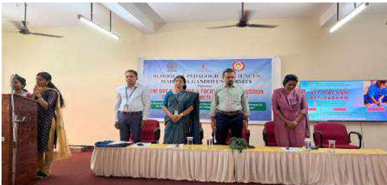
Figure 5 Prayer: SPS MGU Chorus