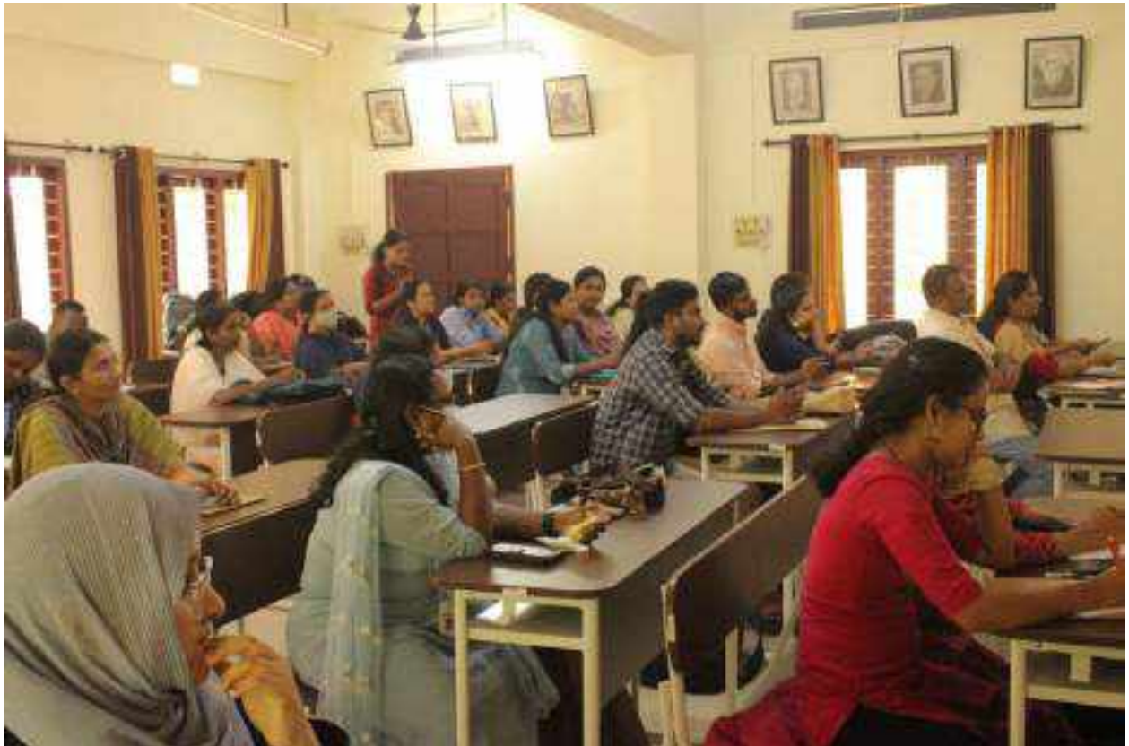
Figure 55 Feedback, Comments, Inputs, Constructive Suggestions and Reflections from the audience