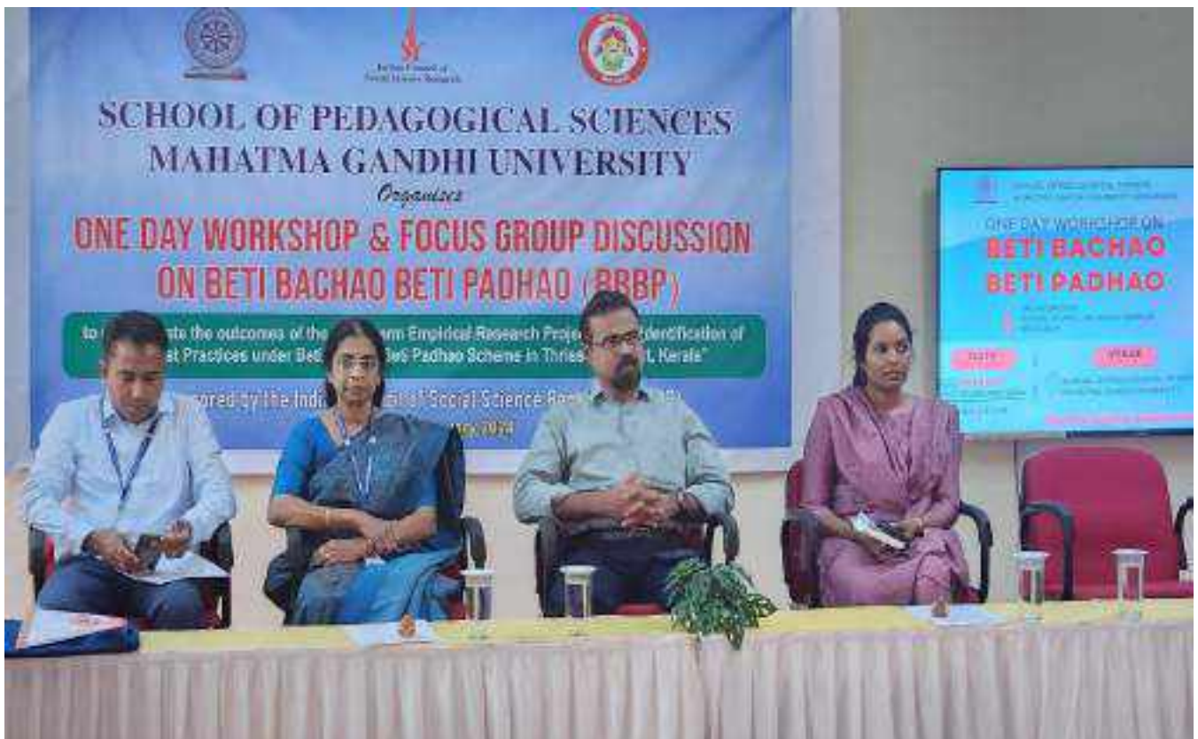
Figure 16 Inaugural Session