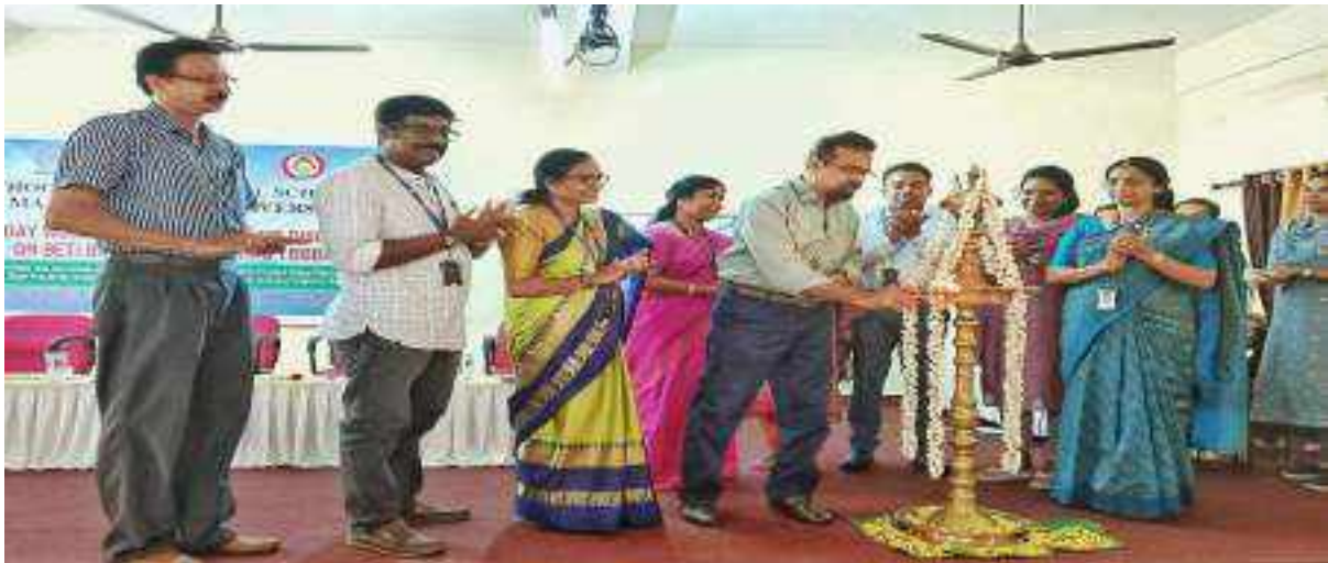
Figure 7 Lamp Lighting Ceremony