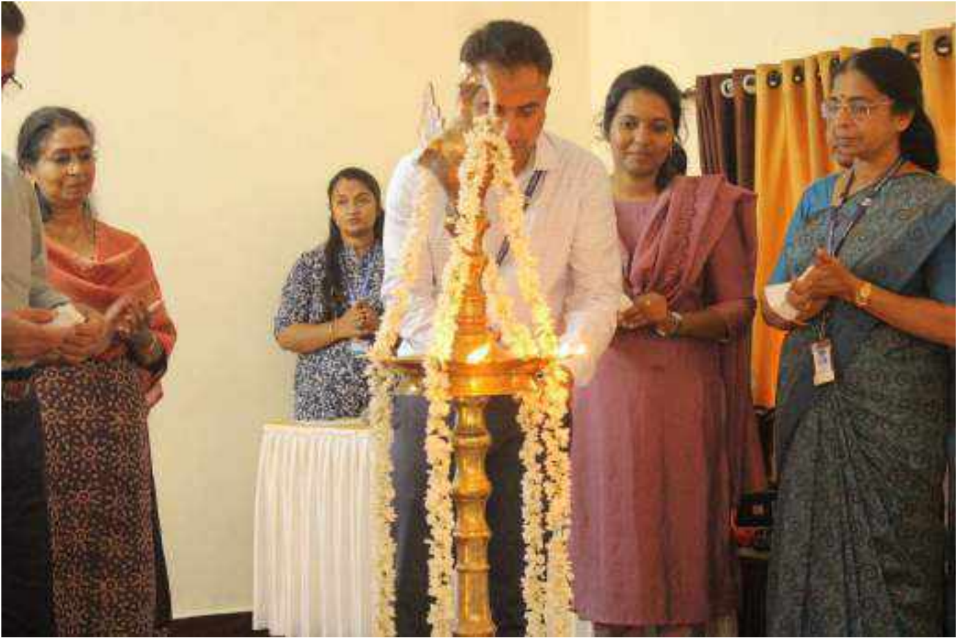
Figure 9 Lamp Lighting Ceremony