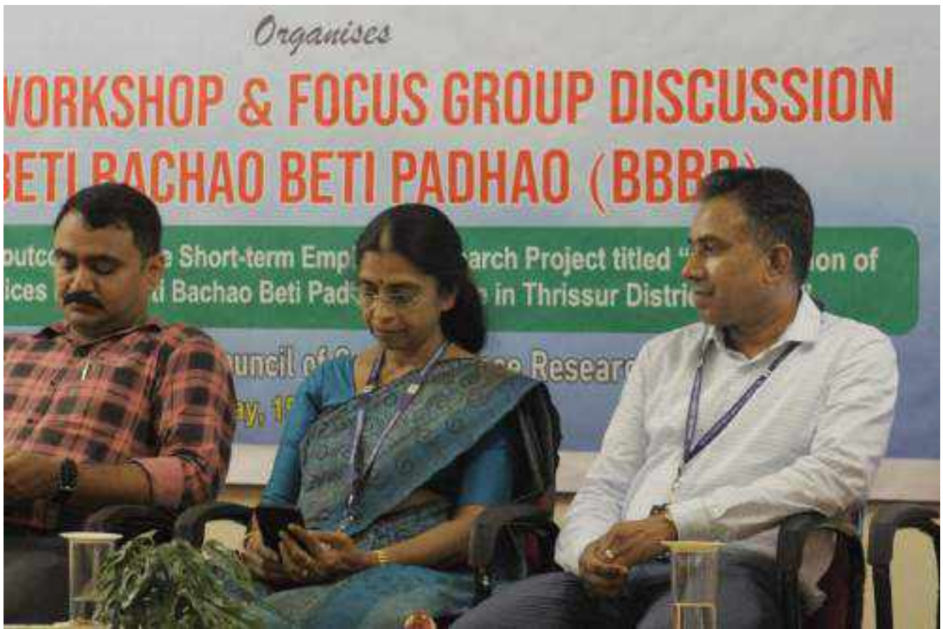
Figure 46 Focus Group Discussion on "Save the daughter, Educate the daughter"