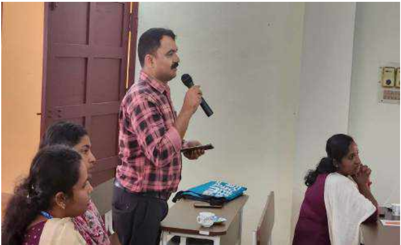
Figure 22 Audience interacting with the Resource Person