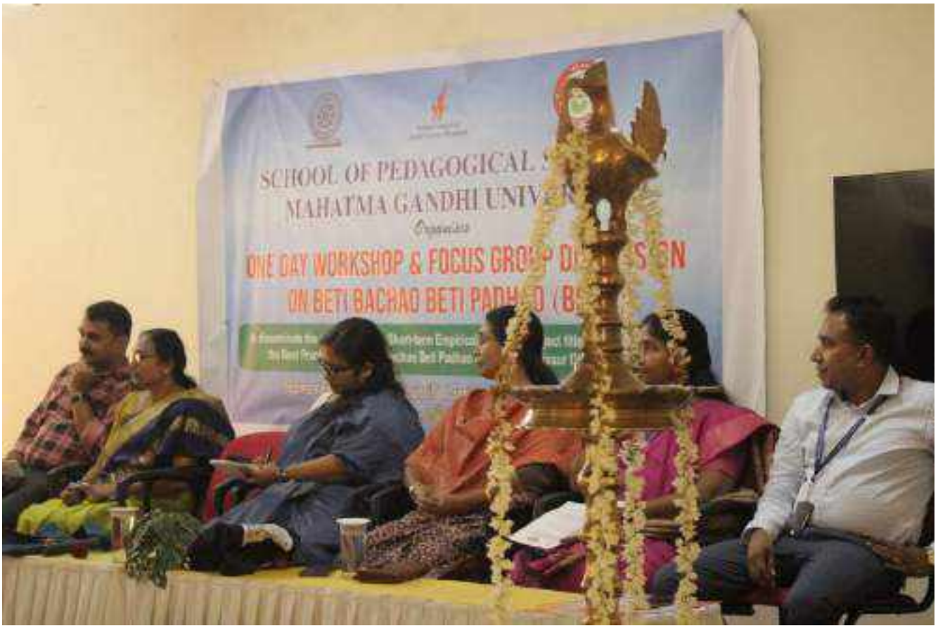
Figure 48 Focus Group Discussion on "Save the daughter, Educate the daughter"