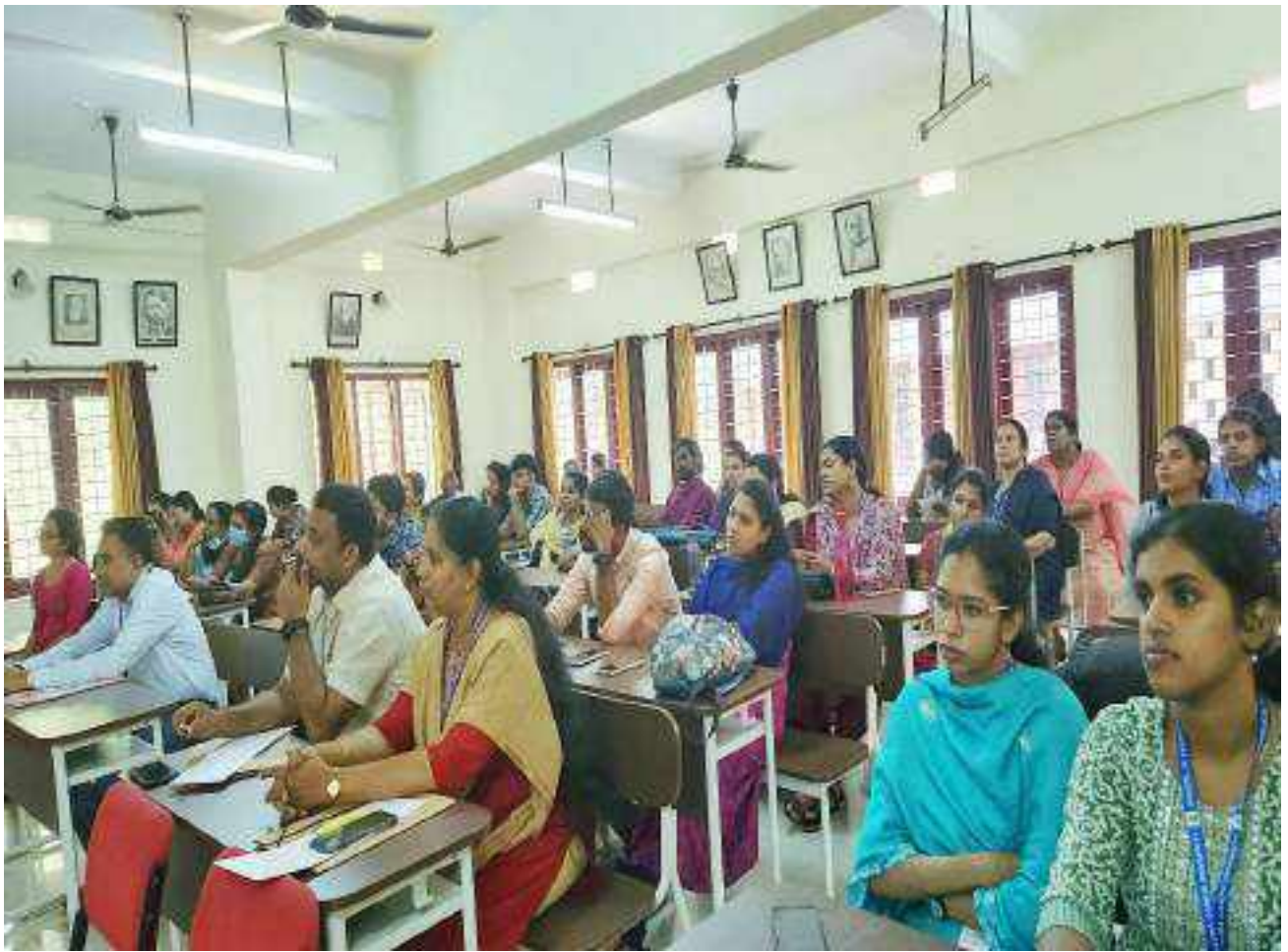
Figure 21 Audience during the Keynote Address