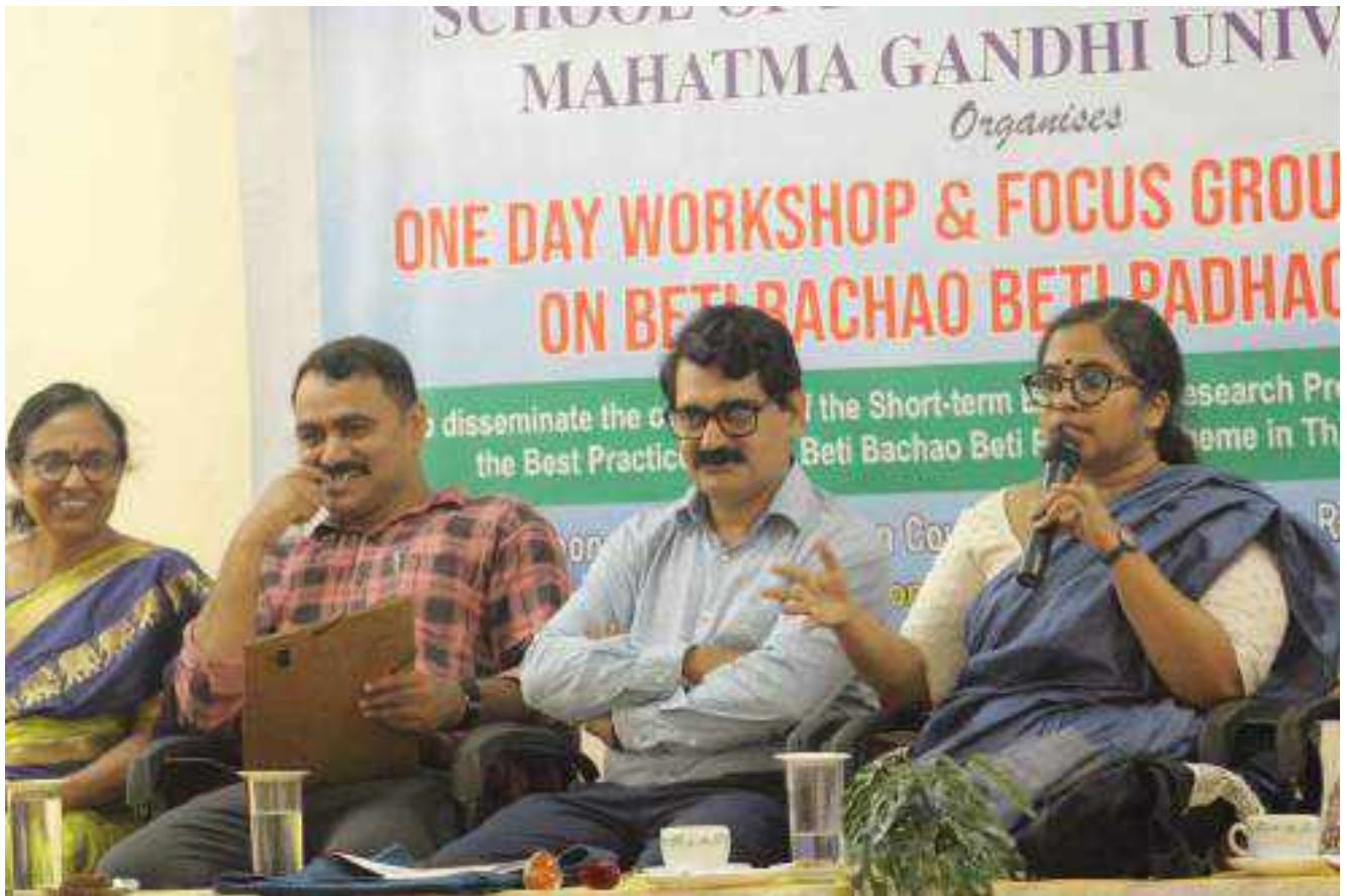
Figure 51 Focus Group Discussion on "Save the daughter, Educate the daughter"