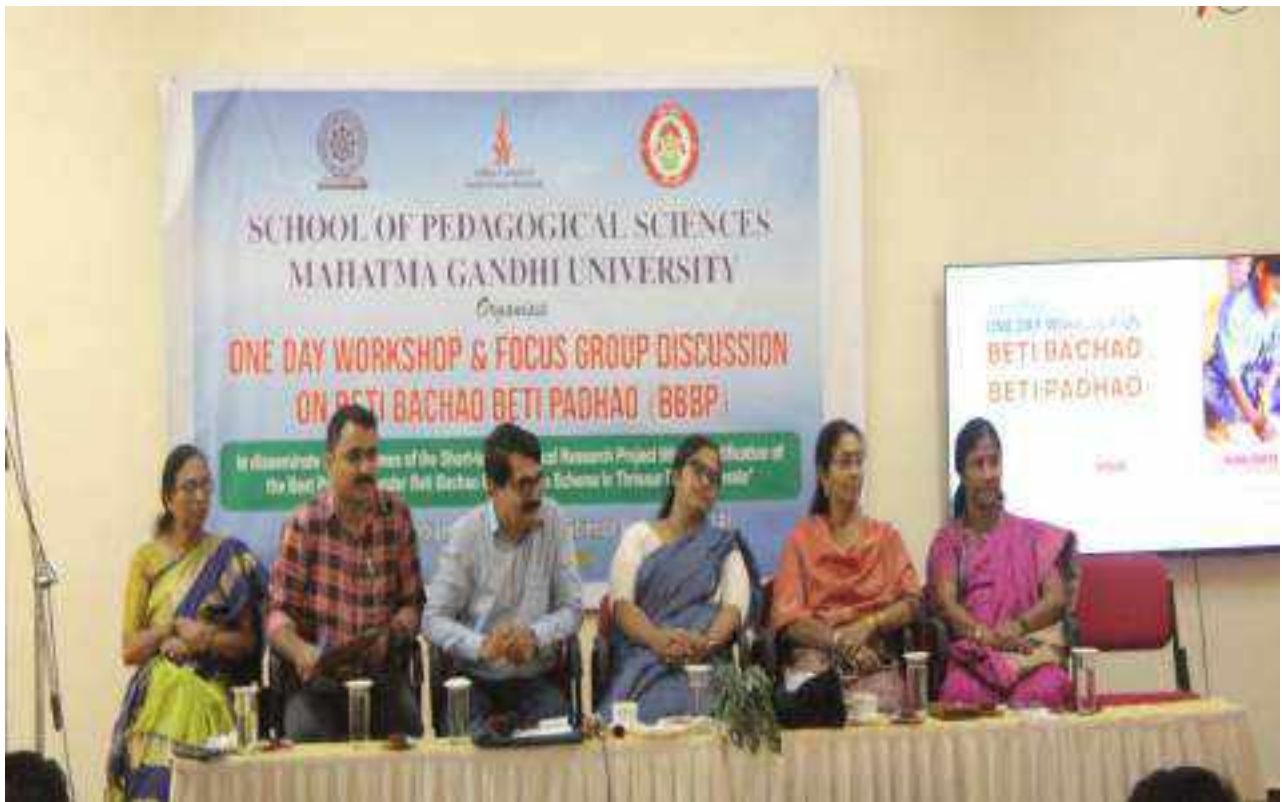
Figure 52 Focus Group Discussion on "Save the daughter, Educate the daughter"