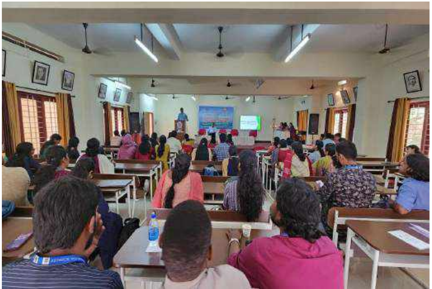
Figure 27 Audience