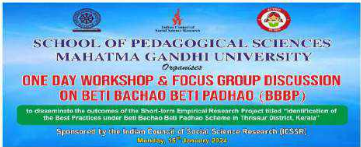
Figure 4 Stage Banner