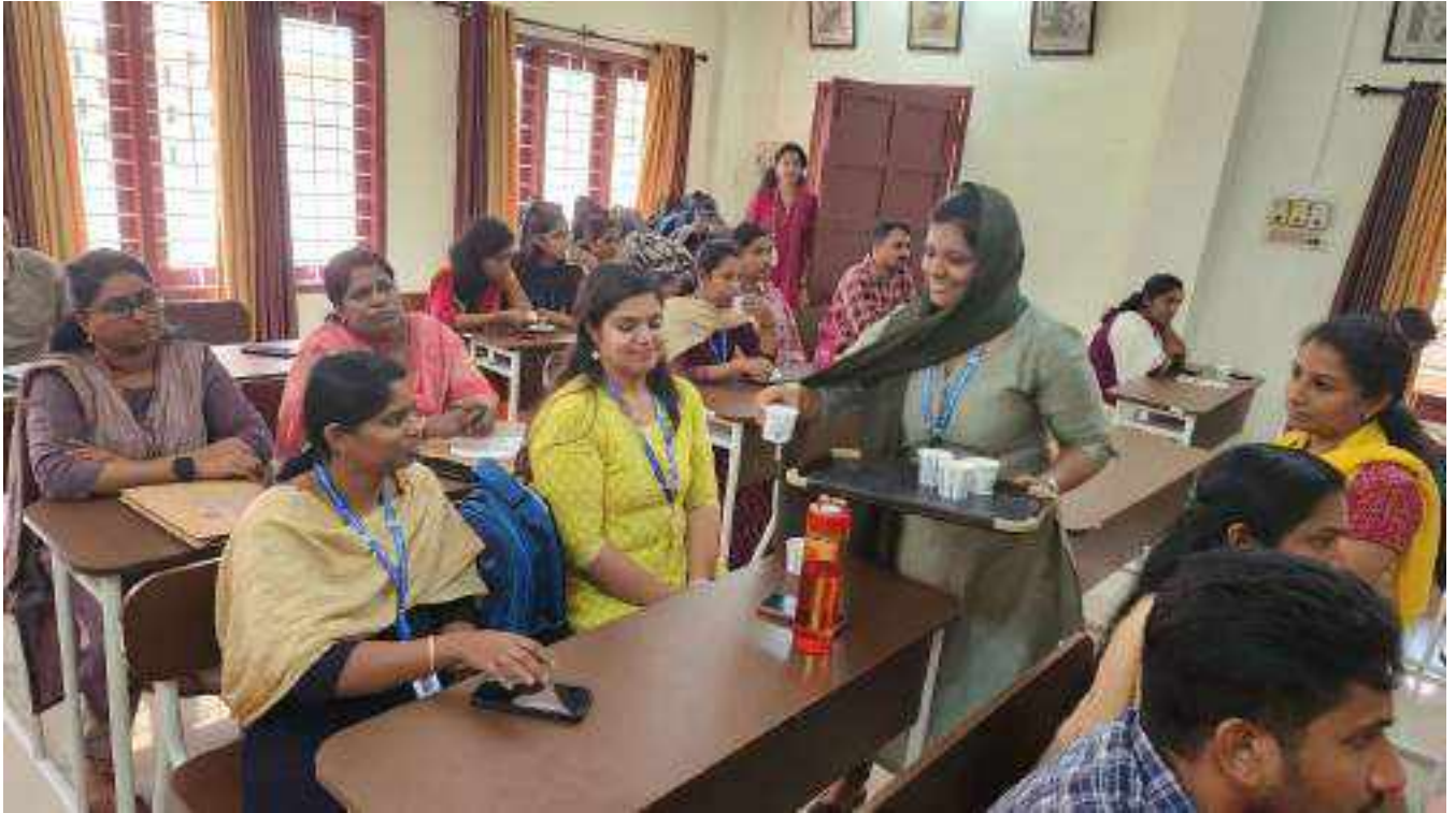
Figure 33 Serving Refreshments