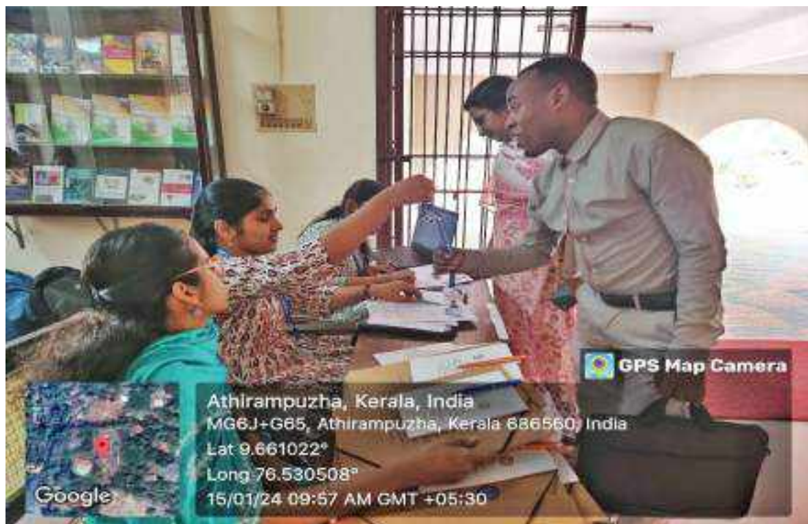
Figure 2 Registration and Reception