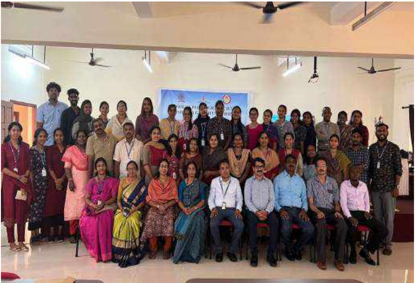
Figure 62 Group Photo Forenoon