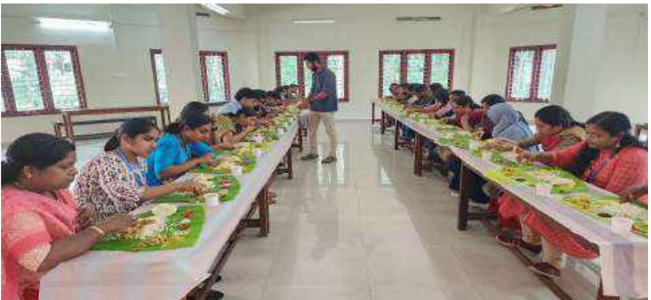
Figure 37 Lunch