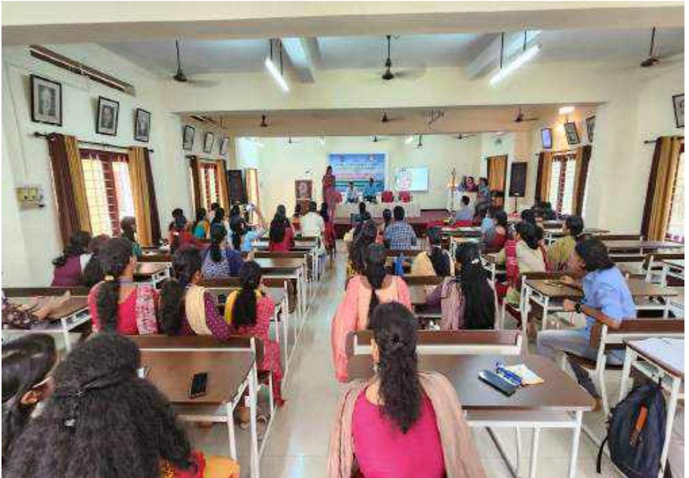
Figure 23 Audience