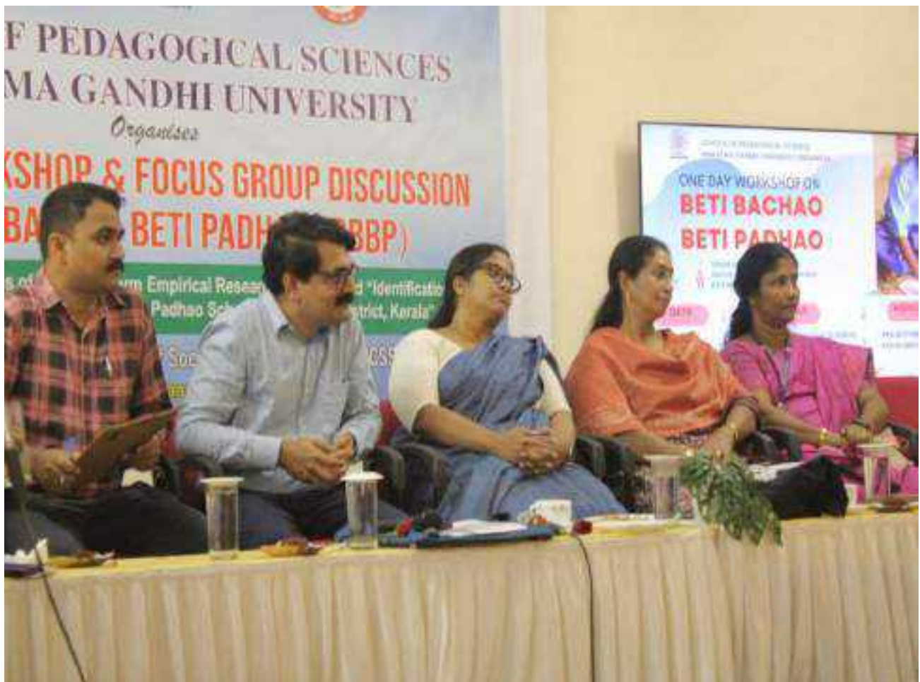
Figure 53 Focus Group Discussion on "Save the daughter, Educate the daughter"