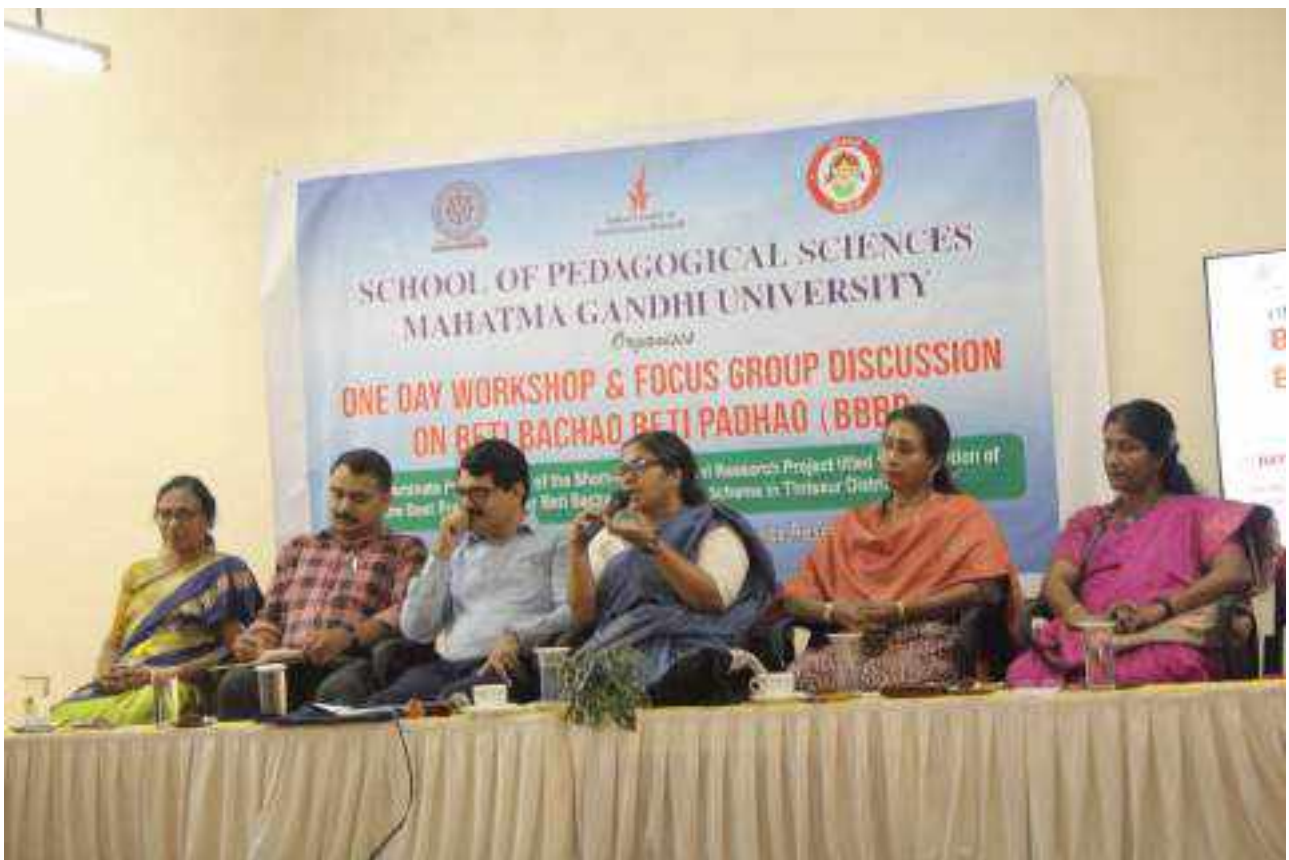
Figure 47 Focus Group Discussion on "Save the daughter, Educate the daughter"