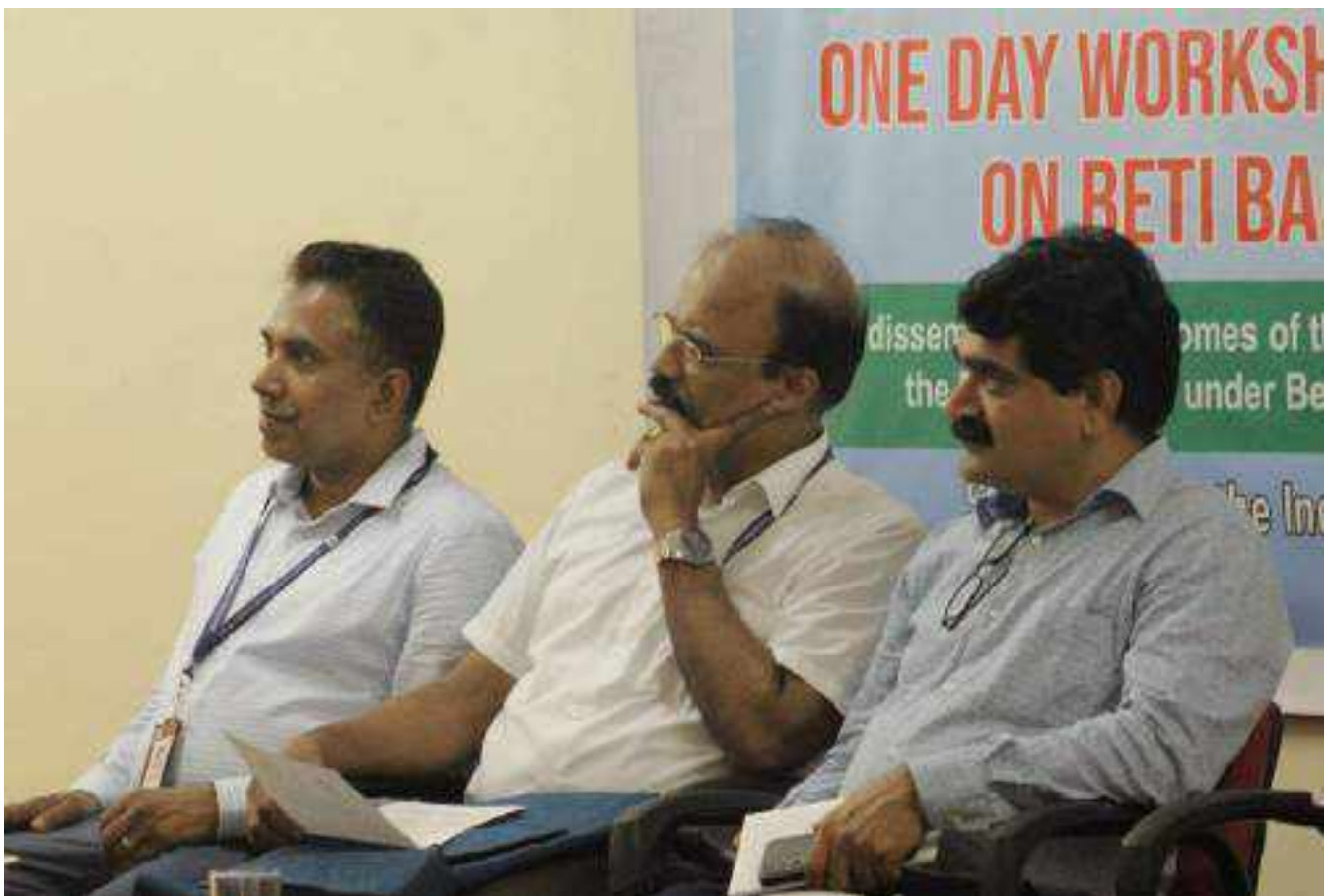
Figure 61 Valedictory Session