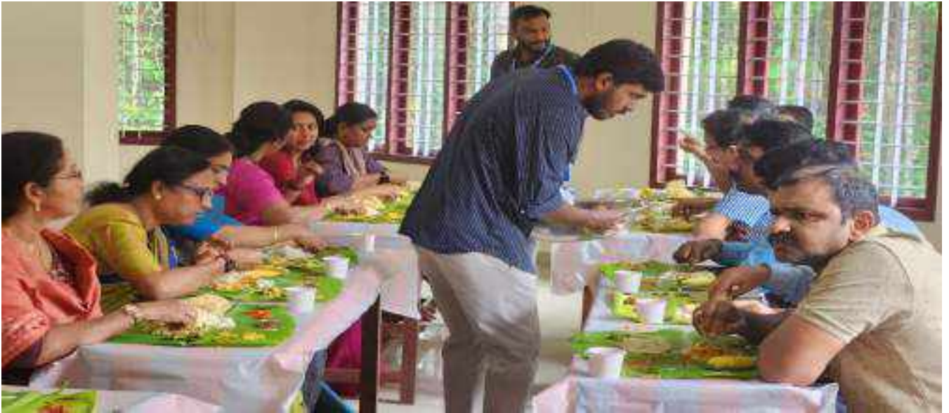
Figure 35 Lunch