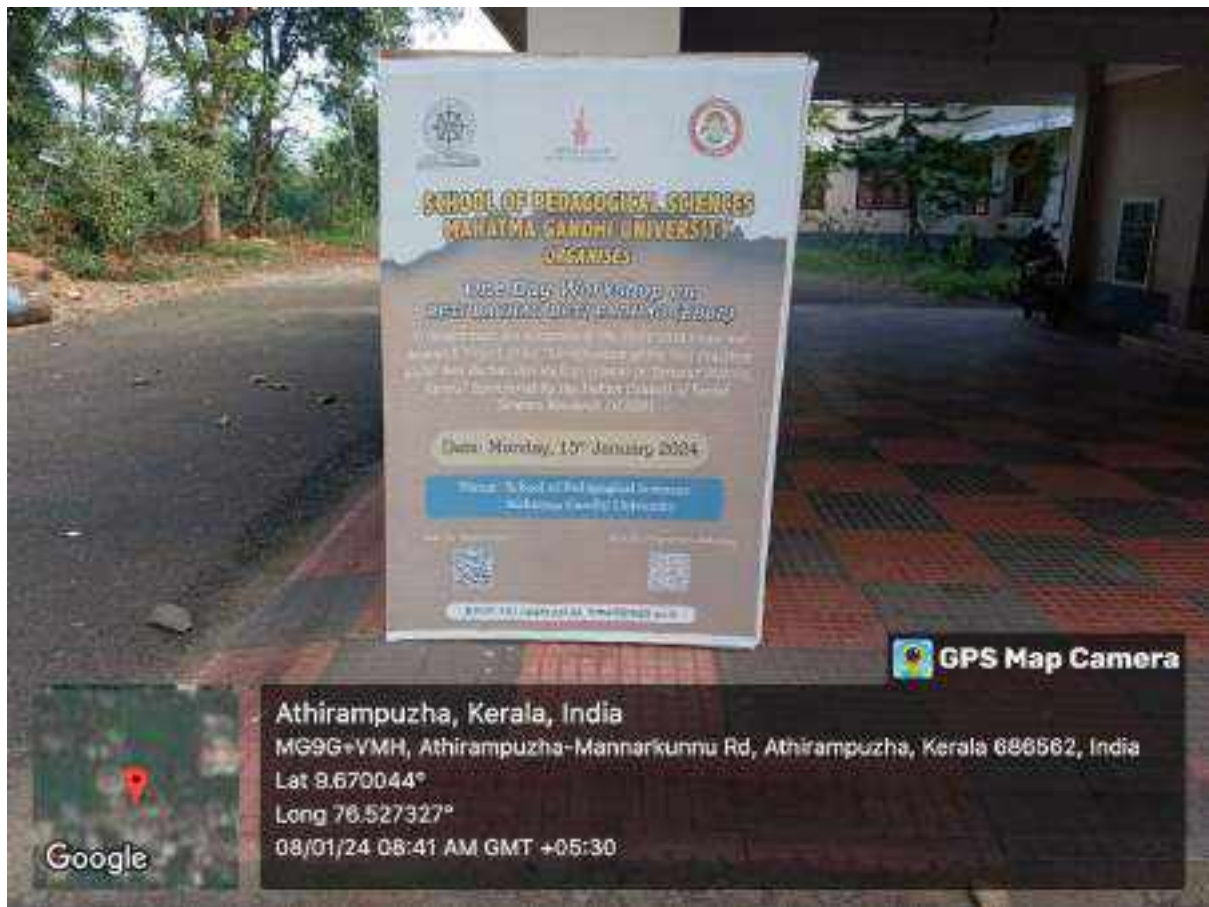
Figure 1 Welcome Board