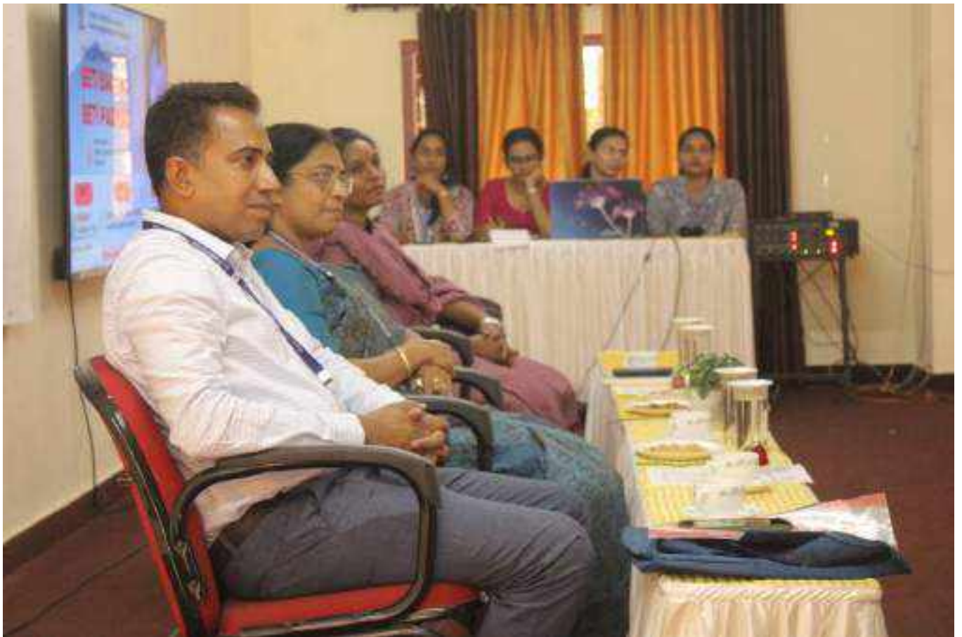
Figure 17 Inaugural Session