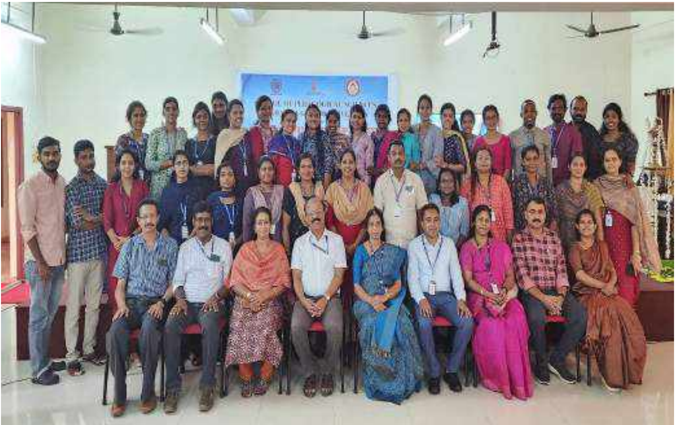
Figure 63 Group Photo Afternoon