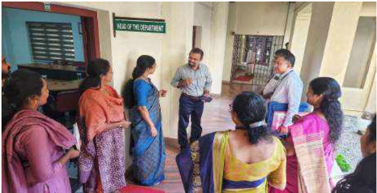
Figure 3 Arrival of the Hon Vice Chancellor & other Guests