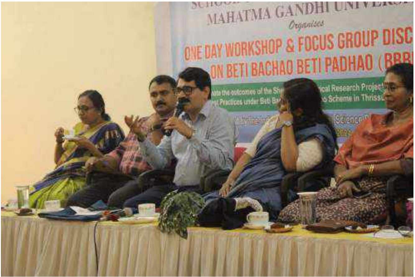
Figure 50 Focus Group Discussion on "Save the daughter, Educate the daughter"