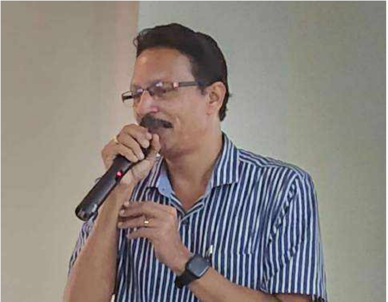
Figure 54 Feedback, Comments, Inputs, Constructive Suggestions and Reflections from the audience