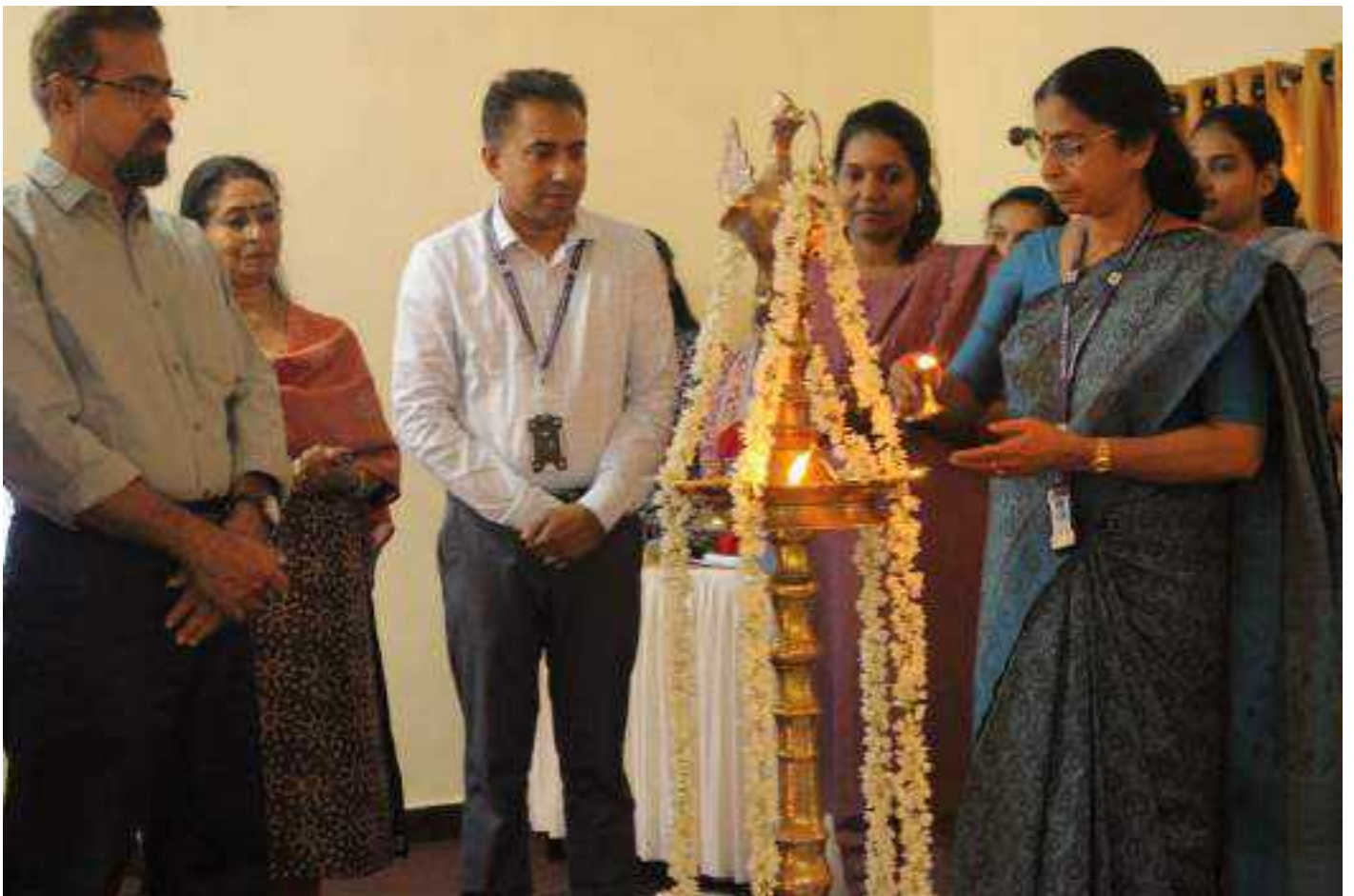
Figure 10 Lamp Lighting Ceremony