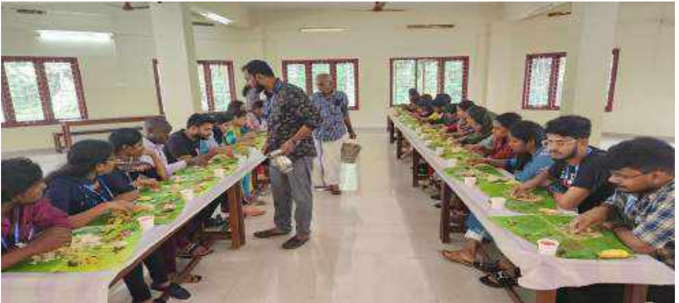
Figure 36 Lunch