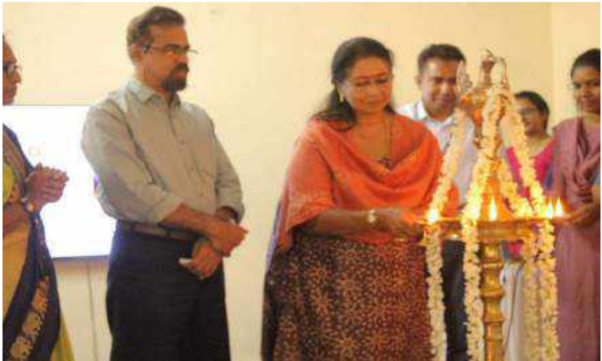
Figure 8 Lamp Lighting Ceremony