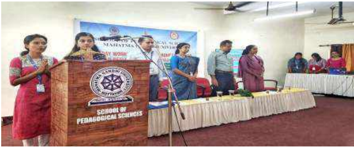
Figure 6 Prayer