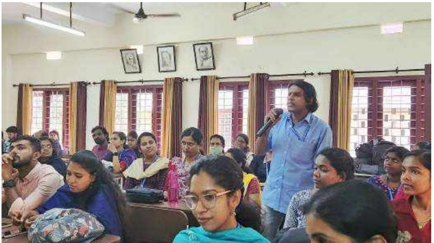
Figure 26 Audience interacting with the Resource Person