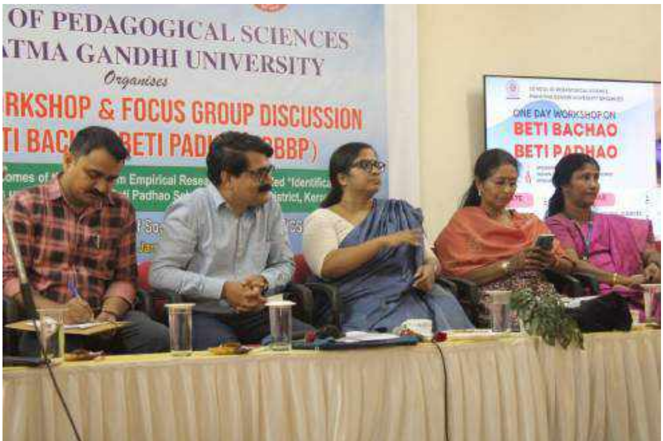
Figure 49 Focus Group Discussion on "Save the daughter, Educate the daughter"