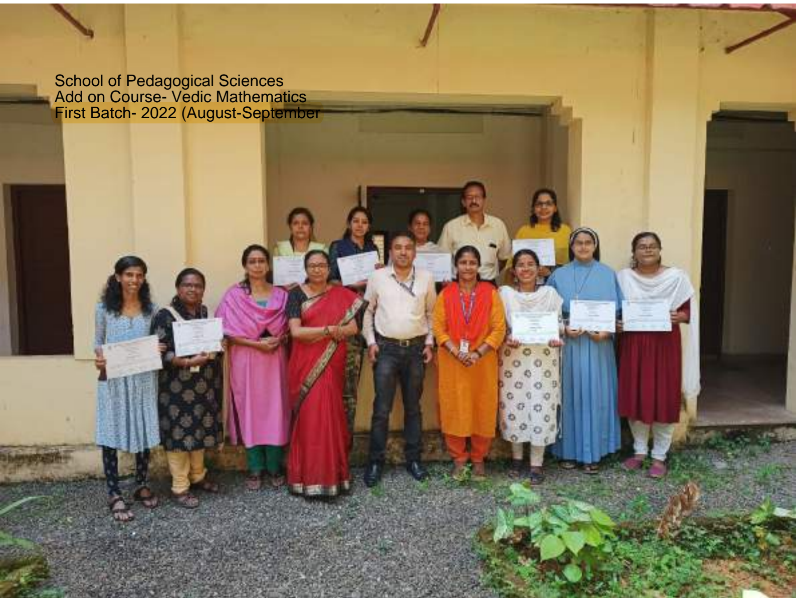
School of Pedagogical Sciences Add on Course- Vedic Mathematics First Batch- 2022 (August-September)